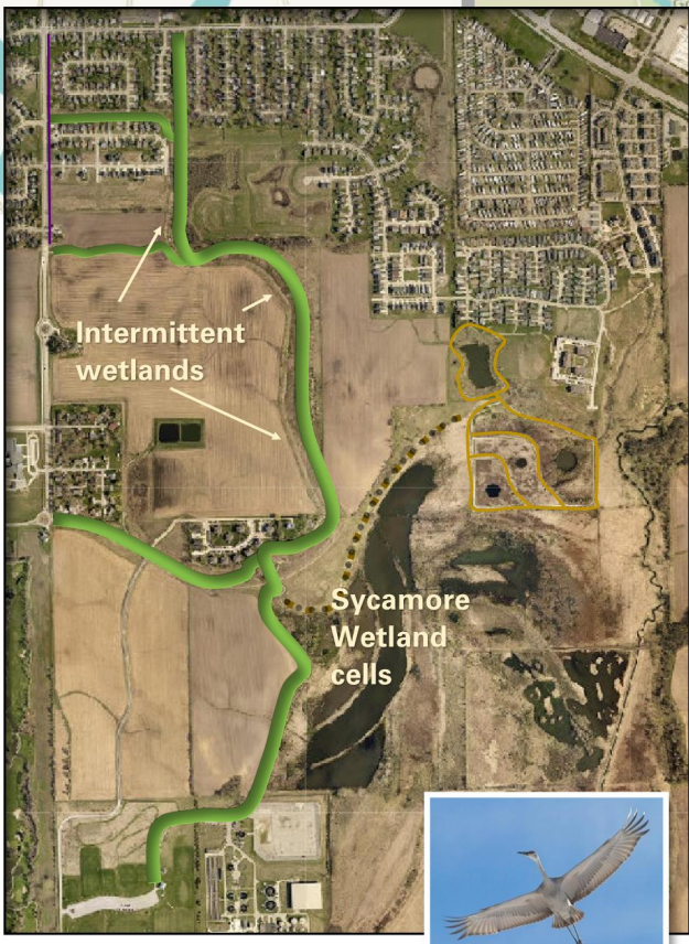
Watch for sandhill cranes and migrating waterfowl in the spring.

The Greenway also provides wildlife habitat. More than 130 bird species, including sandhill cranes, may be observed along the Greenway, and hundreds of waterfowl visit the area each year during migration season. Beaver help to maintain the wetland system. Several species of turtles and frogs live in the area around the Greenway.