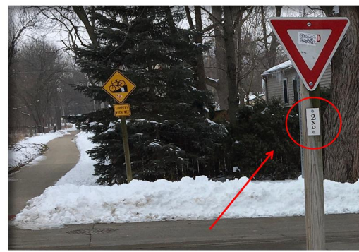
A helpful neighbor has posted plaques along this portion of the trail to identify cross streets west of 1st Avenue.