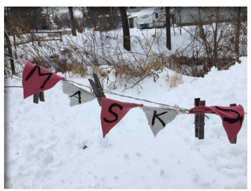
A sign of the times: a public health promotion along the trail offering free masks! Be safe. Be well.