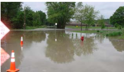
Scene from last year's flood: the intersection of Dubuque Street and Foster Road.

they are not inundated during future flooding. The City is coordinating with the University on this project regarding Mayflower Residence Hall and the new location for Hancher Auditorium. The City will also be completing a grant application to the Federal Transportation Investment Generating Economic Recovery (TIGER)