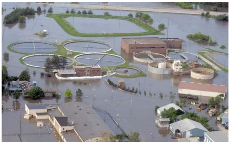
A view of the City's North Wastewater Treatment Plant, surrounded by floodwaters last June.

In last week's issue of The Planner , (July 27, "State of Iowa Single Family Housing Program: Construction gets underway!"), we stated that the downpayment assistance offered to eligible homeowners in the program would be forgiven if the owner lived in the home for 10 years. The term is actually five years.