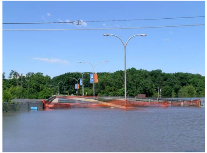
Dubuque Street (left, overlooking the University of Iowa Mayflower Residence Hall) and Park Road Bridge (above) were inundated with floodwater last summer. The City is applying for grant funds to reconstruct and elevate the street and bridge for future flood protection.

they are not inundated during future flooding. The City is coordinating with the University on this project regarding Mayflower Residence Hall and the new location for Hancher Auditorium. The City will also be completing a grant application to the Federal Transportation Investment Generating Economic Recovery (TIGER)